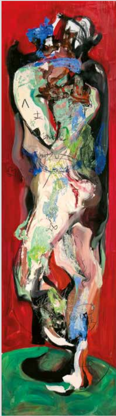
WU JIARU, Door Gods i & ii , 2020, oil on wood, 240×60 cm. Courtesy the artist.

representative work from that period. In flat light, unrecognizable fragments—broken bodies or the remnants of objects left in the street after chaos and conflict—float on a silver background. When photographed with a remote flash, the use of reflective paint creates a different dynamic. Illuminated by the glare of the light, the painting almost ignites, bringing to mind a street engulfed in flames. Meanwhile, the later diptych, Door Gods i & ii (2020), borrows the form of traditional Chinese door gods. Presented as two vertical abstract paintings, they differ from traditional door gods who tend to convey a fiercer, more murderous power. In Wu's paintings, they are blurred but solid bodies, somewhere between