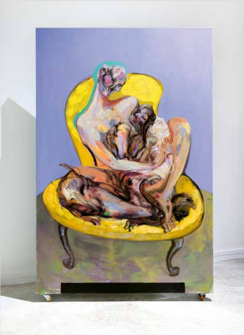
Installation view of WU JIARU's familyTime_97_liveStream , 2022, oil and acrylic on linen, 120×90 cm, at "To the Naiad's House," Flowers Gallery, Hong Kong, 2022. Courtesy the artist and Flowers Gallery.

"Memory is not that solid and believable. For example, we all experienced the Hong Kong handover in 1997, and my memory of it is of a mother sitting on a sofa holding a child, so I drew familyTime_97_liveStream (2022). I remember the chair better, with its ostentatious decorations, but I knew that the Hong Kong handover was being shown on the television outside the frame, and perhaps this memory was mixed with the visual memories I had of the jau lau . As a child born and raised in Guangdong, until I came to live in Hong Kong, Hong Kong was a symbol mediated through various mediums: the television, the McDonald's Happy Meal, the space of the jau lau . These were all mediums that shaped Hong Kong [for me]."