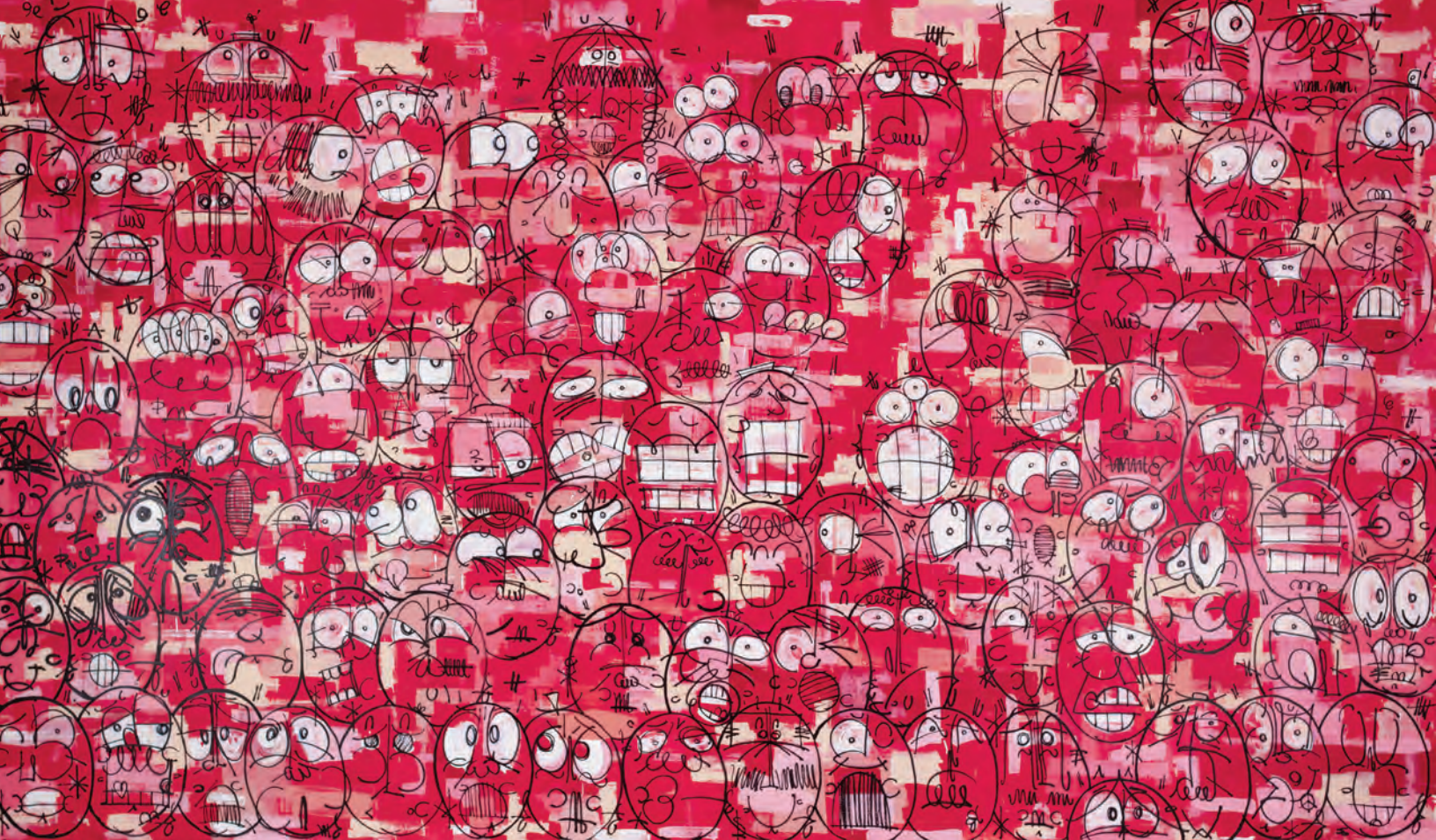
Untitled, 2019, acrylic and oil on canvas, 289.5×487.5 cm.

washy, buffed-out grounds of blues, grays, reds, pinks, oranges, and beiges—evoke the palimpsest that forms the basis of all graffiti. Wall writing is in a constant state of evolution and change due to the actions of fellow writers and graffiti removal (“buff”) squads who, more often than not, allow traces of past efforts to remain visible. In these paintings, Curtis builds on aspects of Barry McGee’s gallery-based art of the early 2000s, which explored the relationship between tagging and buffing.