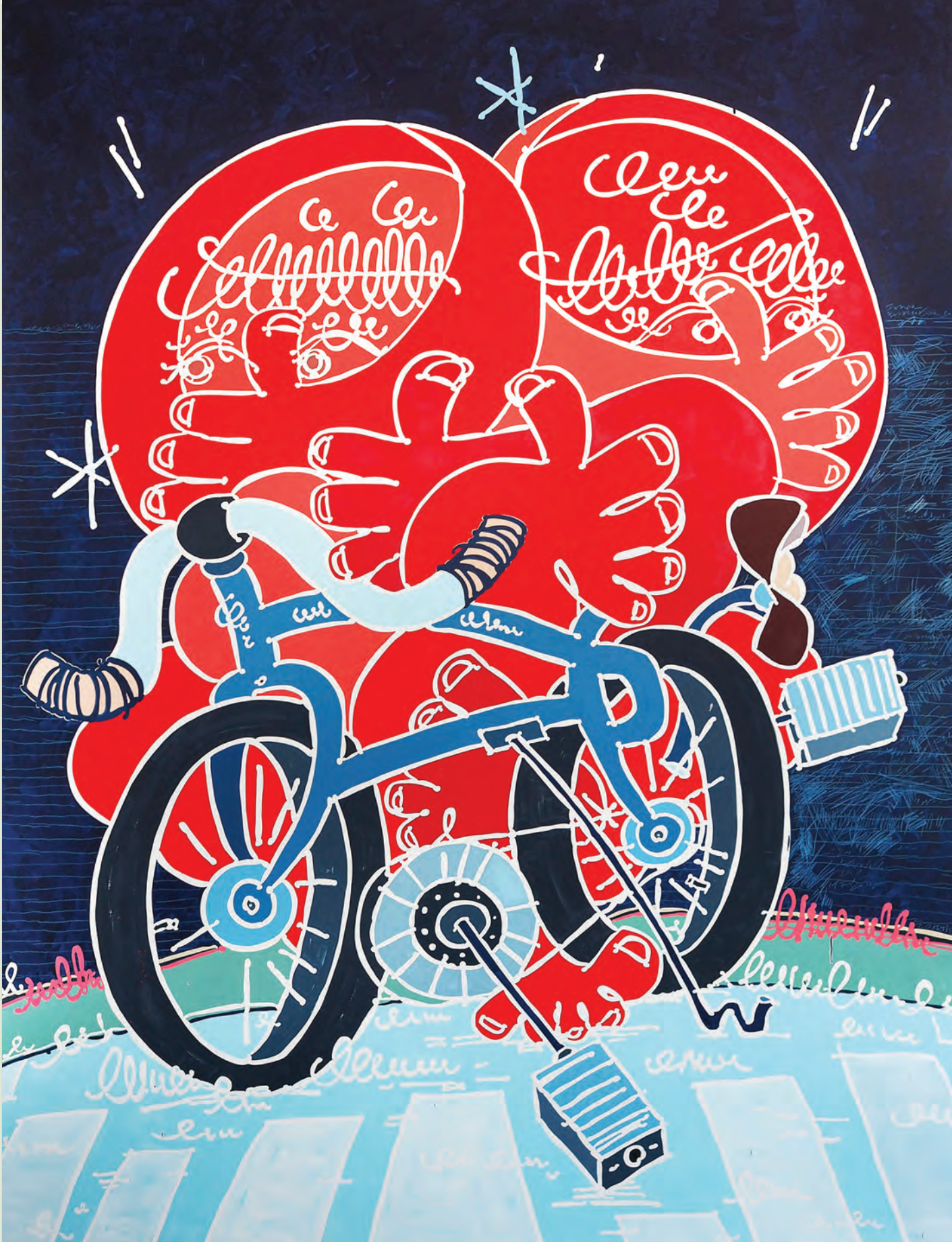
Together We Might Get Away , 2019, oil on canvas, 244 x 183 cm.