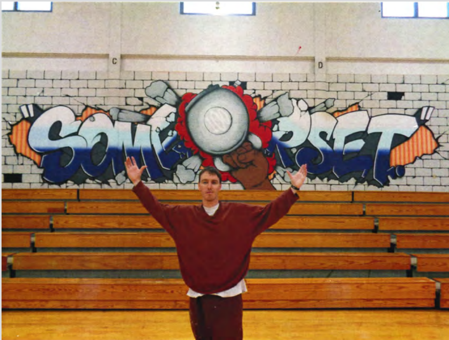
Portrait of the artist in front of Destroy Somerset , 2015, acrylic paint and floor wax on wall, 457.2 × 2,286 cm.

Curtis's fascination with drawing and painting faces evolved on the streets of Philadelphia in the late 1990s, when he was a young graffiti writer. In combining a "wild style" version of his AGUA tag (known as a "wicket")—featuring nearly illegible letterforms—with an expressive face, Curtis developed his own argot, a "secret, underworld handshake" that only diehard fellow writers would be able to read and recognize as his. Curtis notes that the wicket/face combination is a 1970s graffiti creation—an adaptation of the