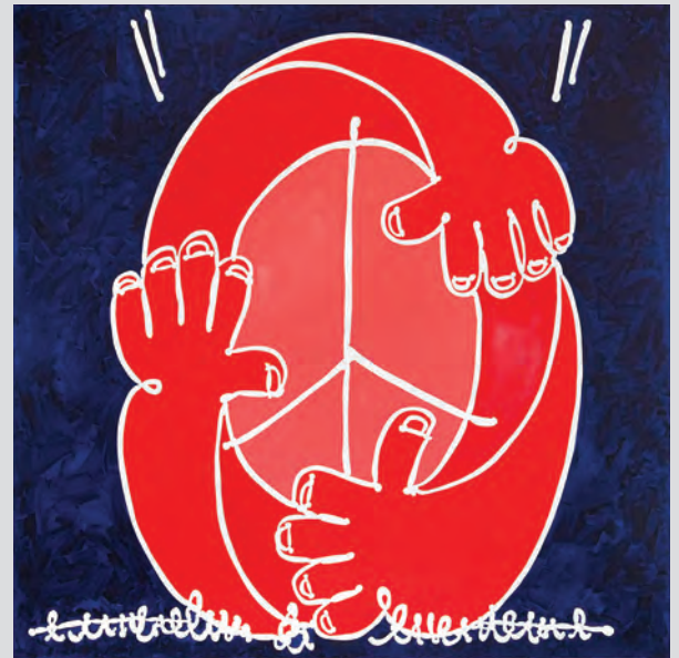
Peace Recycle , 2019, oil stick and oil paint on canvas, 152.4×121.9 cm.

While Curtis has achieved sudden success since gaining his freedom in November 2015—with a 2017 solo exhibition at Kaikai Kiki's Hidari Zingaro Gallery in Tokyo, to name one example—it is his inclusion in the aforementioned exhibition at the Drawing Center that might be the highlight, to date, of his meteoric rise. "The Pencil Is a Key," features a wide range of artists, from the 19th century to the present, who created drawings while incarcerated, such as political prisoners, captives of the Soviet Gulag system, the mentally ill confined to asylums, Japanese-American artists held in US internment camps during World War II, and inmates within the contemporary American penal system. As part of a diverse array of artists including Gustave Courbet, Egon Schiele, Otto Dix, Max Ernst,