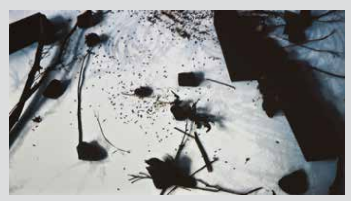
YEHUDIT SASPORTAS, The Magnetic Shaky Tables, 2013, stills from film in loop with sound: 16 min 9 sec.