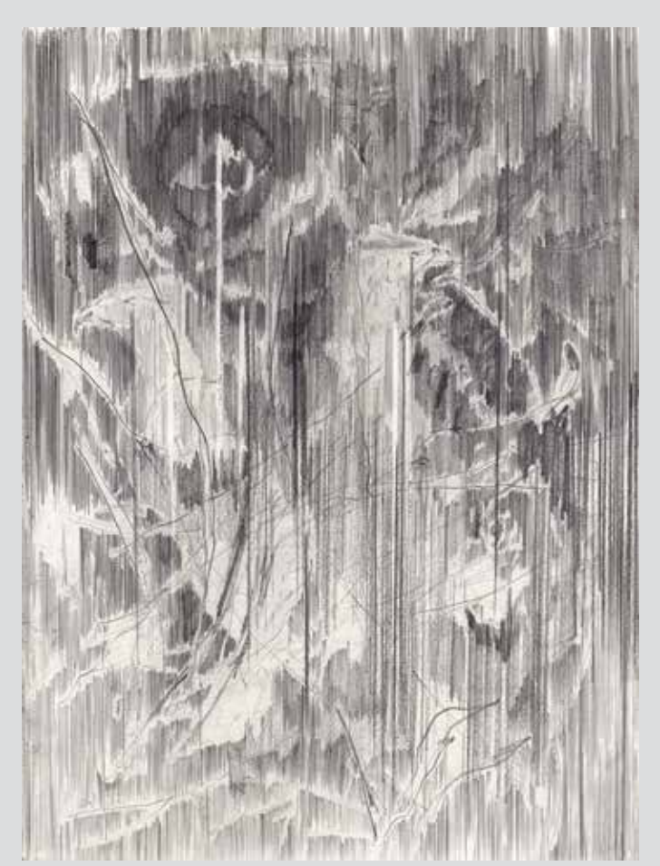
YEHUDIT SASPORTAS, The Witness Drawing no. 15 (2020), from Liquid Desert Project, 2013-, graphite drawing on paper, 61 × 45.7 cm.

My focus is on things in life that happen against our will. What is happening to us when we are forced to do something, maybe