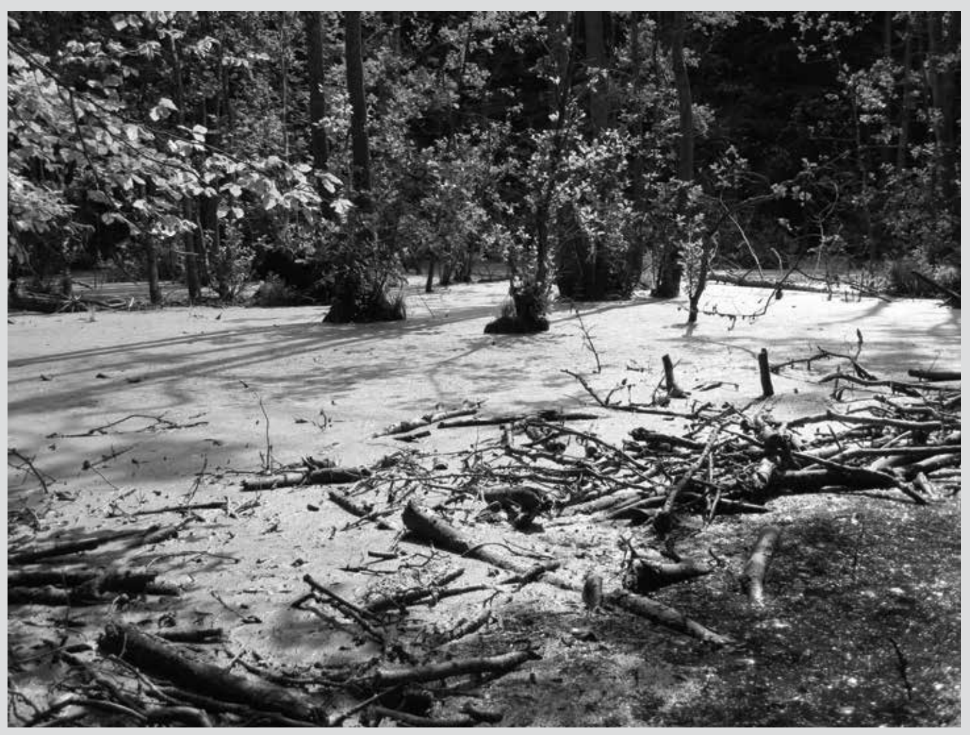
The Swamp (Dreesberg Bog), 2007.