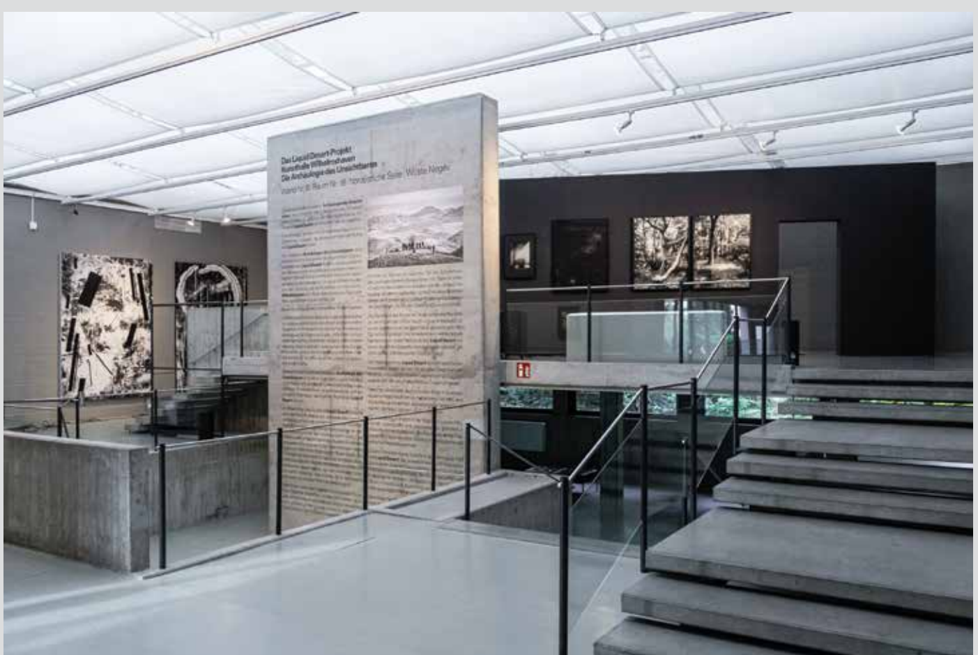
Top: The Negev Desert in the south of Israel and site of Liquid Desert Project. Bottom: Installation view of YEHUDIT SASPORTAS's "The Archeology of the Unseen" from the Liquid Desert Project, 2013-, at Kunsthalle Wilhelmshaven, 2020-21.